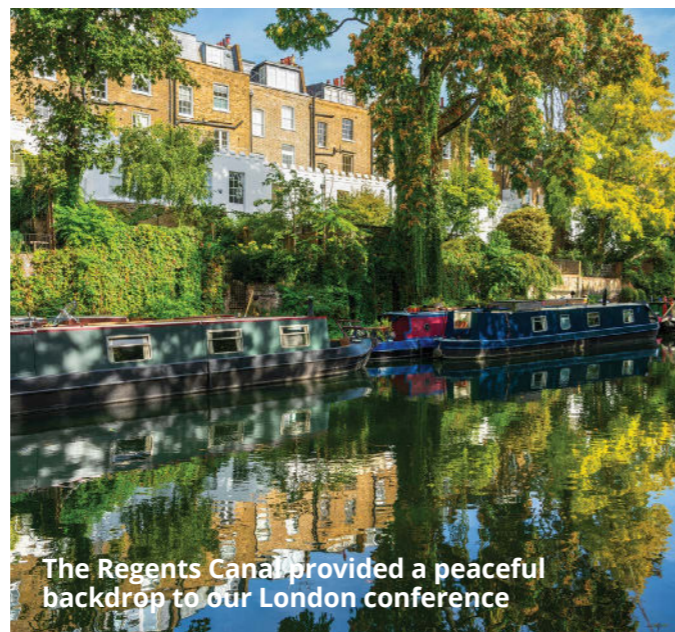
The Regents Canal provided a peaceful backdrop to our London conference